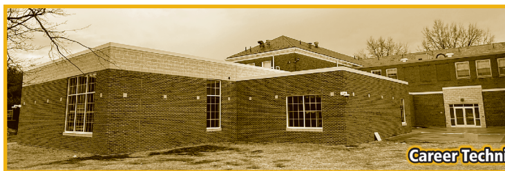
Career Technical Education (CTE)