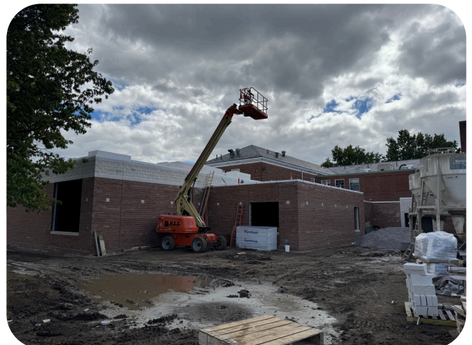
*Career Technical Education (CTE) addition groundbreaking ceremony & construction progress.